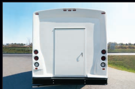
Stylish fiberglass rear cap with rear luggage access door