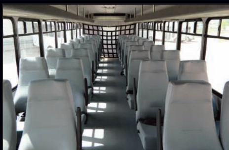
Spacious interior with high-back seats and overhead luggage racks