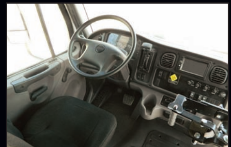
Comfortable and easily-accessible driver's area