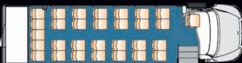
29 Passenger with Rear Luggage Plus Driver