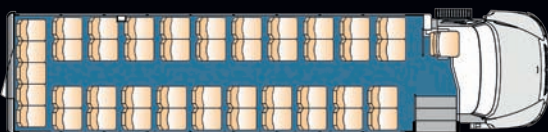
45 Passenger Plus Driver

Starcraft Bus, a division of Forest River, Inc., is owned by Berkshire Hathaway, one of the most respected and financially secure companies in the industry.