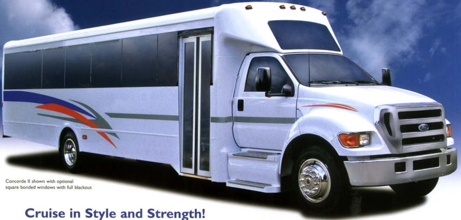
Concorde II shown with optional square bonded windows with full blackout.