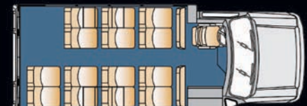
14 Passenger with Activity Bus Seats