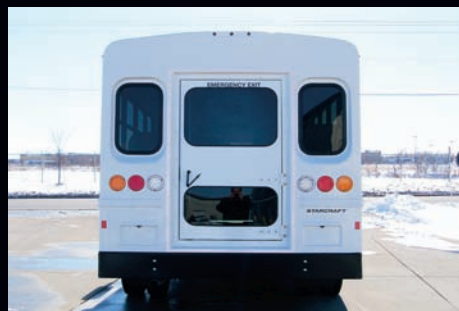
Stylish fiberglass rear cap comes standard on the Prodigy XP