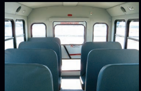
A choice of standard school bus seats is available on the Prodigy XP