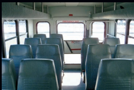
A choice of standard activity bus seats, optional overhead and rear storage are shown above