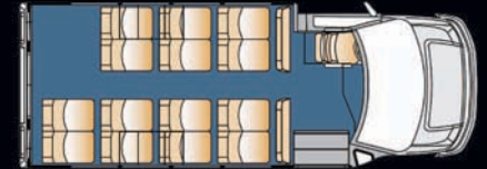
14 Passenger with Activity Bus Seats